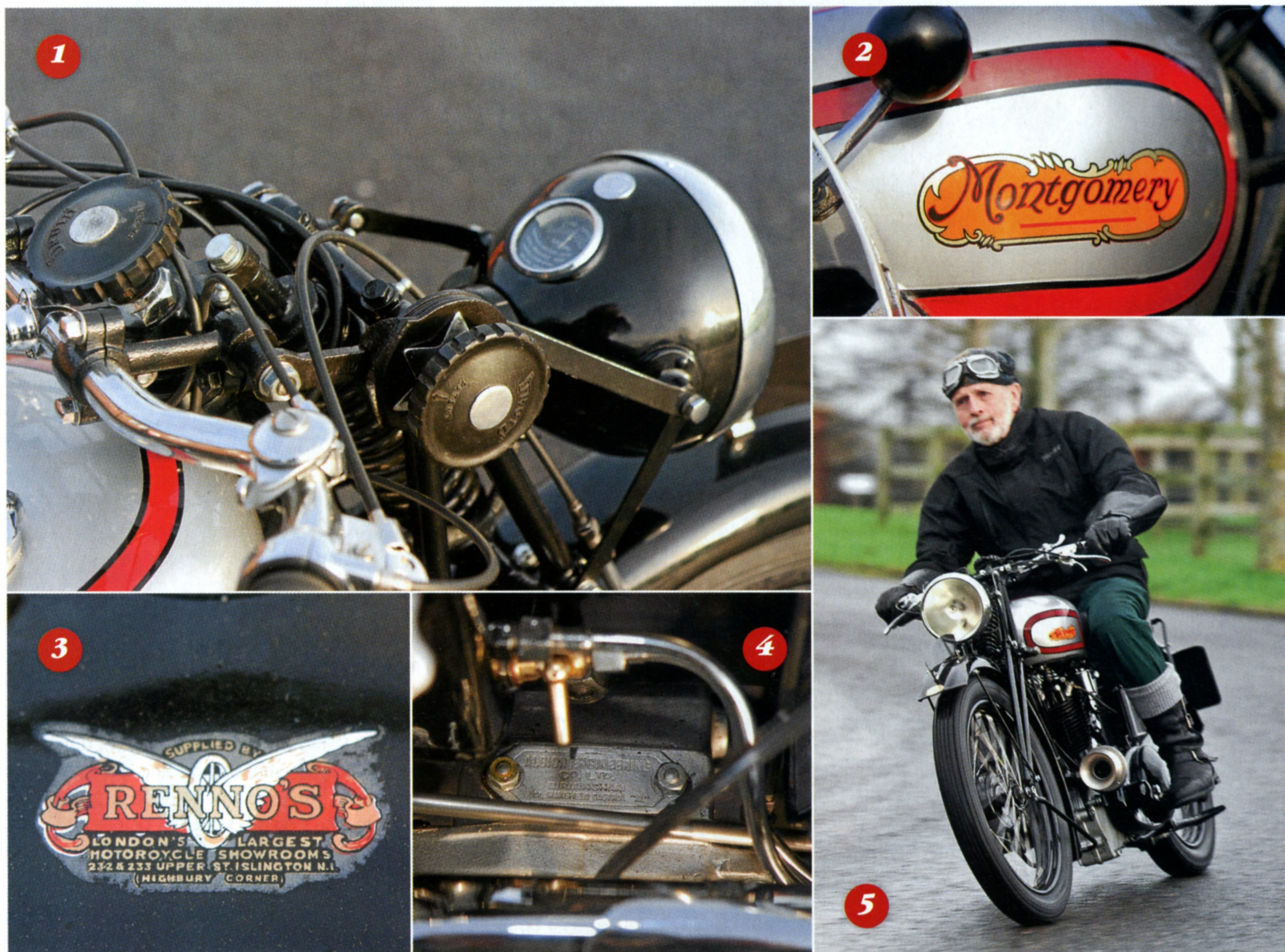
1 There are steering and friction damper knobs. 2 Montgomery was originally founded in Suffolk. 3 Renno's transfer boasts of the firm's showroom. 4 Novel form of chain lubrication. 5 Capable and stable, the Montgomery feels much younger than its years.

It sounded a bit desperate, but Montgomery had already survived many setbacks, and was still determinedly plugging away at the end of the decade when production was halted by the Second World War. Given the firm's longevity it's probable that an attempt would have been made to restart motorcycle production after being diverted on to war work for the duration of hostilities, but it never got the chance as the factory was bombed during the air raids on Coventry. ■