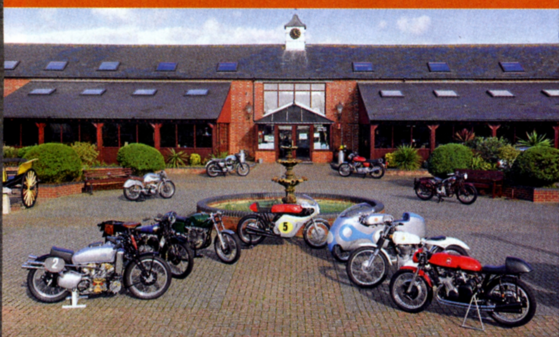
The Sammy Miller Motorcycle Museum is at Bashley Cross Road, New Milton, Hants BH25 5SZ. Tel 01425 620777